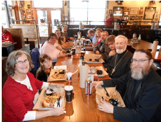
Following the Festal Divine Liturgy on 7 January, twelve disciples of the Newborn Savior continue to celebrate the feast at Mission BBQ in Stafford.