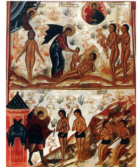
The Sunday of Forgiveness

10:00 a.m. Divine Liturgy followed by Fellowship Hour