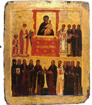
First Sunday of the Great Lent: Triumph of Orthodoxy

9:15 a.m. Congregational Singing Practice 9:45 a.m. Reading of the Third Hour 10:00 a.m. Divine Liturgy followed by Fellowship Hour