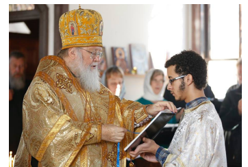
Seraphim serving during Metropolitan Hilarion's visit to St. Herman of Alaska