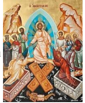
The Bright Resurrection of Christ