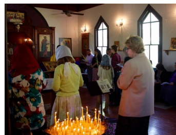
Palm Sunday Holy Unction Matins