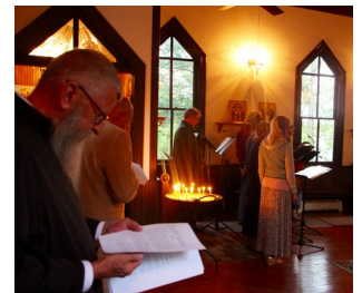
Bridegroom Matins Holy Thursday