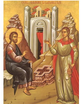
The Samaritan Woman