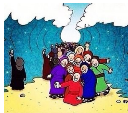
If there were cellphones at the Red Sea

We are registered with two broadcast media weather alert systems: (1) television: WJLA-TV (channel 7) and News Channel 8, and (2) radio: WTOP radio (103.5, 103.9, 107.7 -- all FM) and WTOP.com Any closings will also be posted on the home page of our website and via email to those who have asked to be on our electronic mailing list.