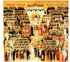
All Russian Saints

10:00 a.m. Divine Liturgy followed by Fellowship Hour