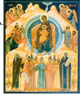
Synaxis of the Most Holy Theotokos

9:15 a.m. Choir Practice 9:45 a.m. Reading of the Third Hour 10:00 a.m. Divine Liturgy followed by Fellowship Hour