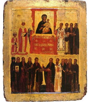
First Sunday of the Great Lent: Triumph of Orthodoxy

10:00 a.m. Divine Liturgy followed by Fellowship Hour