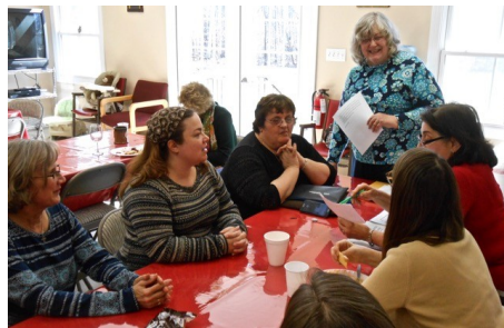
The meeting of the Sisterhood, Feb. 2017 with our out-going senior sister.