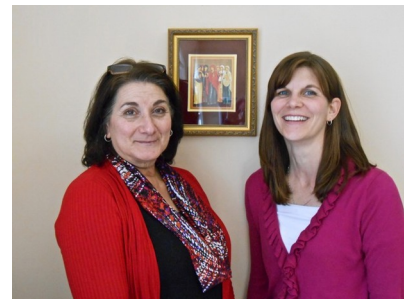
Our new senior sister and treasurer.