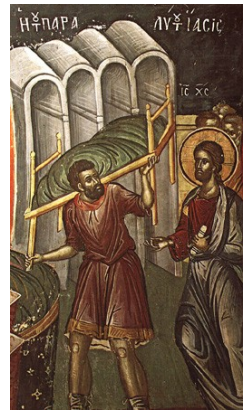
The Paralyzed Man