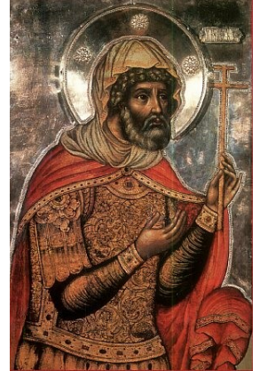
Venerable Longinus the Centurion, who stood at the Cross of the Lord