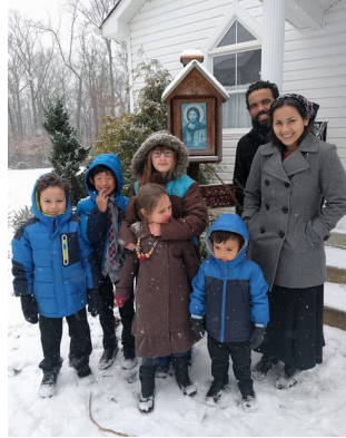
Christ is Born!