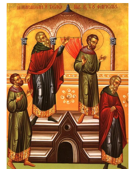
Sunday of the Publican and the Pharisee

9:15 a.m. Choir Practice 9:45 a.m. Reading of the Third Hour 10:00 a.m. Divine Liturgy followed by Fellowship Hour