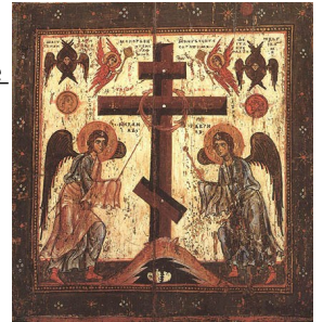
Adoration of the Cross