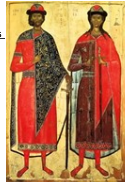
SS Boris & Gleb, Passion-Bearers of Kiev